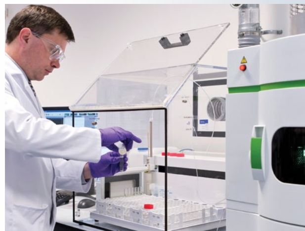
Atomic Emission Spectroscopy Analysis

With Honeywell's analytical reagents, superior quality and safety standards are a prime focus. We use a comprehensive Quality Assurance System in line with EN 29001 (ISO 9001) and each of our products is manufactured to clear, guaranteed specifications. We employ a large variety of modern analytical methods, such as inductively coupled plasma optical emission spectroscopy (ICP-OES), inductively coupled plasma mass spectrometry (ICP-MS), flame atomic absorption spectroscopy (AAS) and graphite furnace AAS (GF-AAS). This allows for specifically tailored control and analysis procedures for each product.