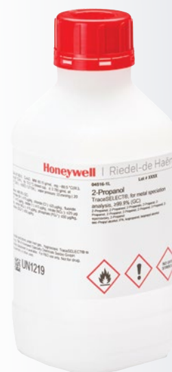
Honeywell Riedel de Haën - 2-Propanol TraceSELECT 04516-1L

The elemental response is usually independent of species, so it is often possible to quantify a species even when its structure is unknown (assuming good HPLC recovery). Identification, however, is based solely on retention time matching. Therefore, a compound in the sample can be identified only by comparison with a standard.