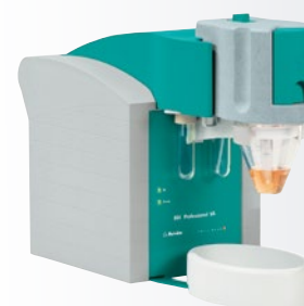
Multi-mode Electrode (MME)