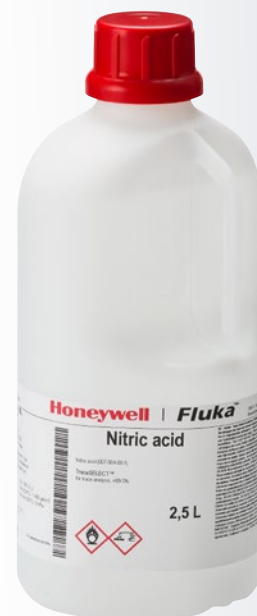
Honeywell Fluka - Nitric Acid TraceSELECT 84385-2.5L

For more information, visit: lab.honeywell.com/traceselect