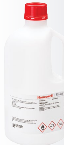
Honeywell Fluka - Nitric Acid TraceSELECT 84385-2.5L

The reduction of metals into mercury is more favourable than reduction to the solid-state electrode. Further on there is always a clean new Hg electrode surface available for each measurement.